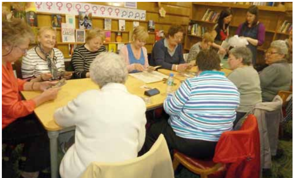
"I can't thank you enough for making us so welcome, the women were talking about GWL all the way home. We really need something similar in Dundee but what with cutbacks it's not going to happen" (Visit from Dundee Women's Group)

GWL continues to be a hub of information and an important centre for research. During the past year 22 people have consulted the Archives in person, many for academic purposes but others have also used the material as a source for their art, to inform their work or just out of curiosity. In addition to individual visits to GWL - including