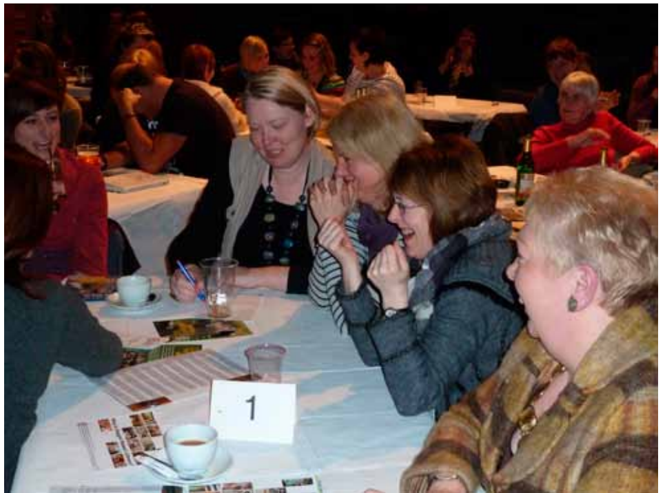
GWL's 'Big Women's Quiz' brought out the competitive sides of all present!

Finally, this year has heralded the creation of our bespoke Learning Impact Monitoring Tool, Library Out Loud (LOL). This database enables the Learning Team to record and report on every aspect of our performance and measures it against our own Learning Policy and local and national