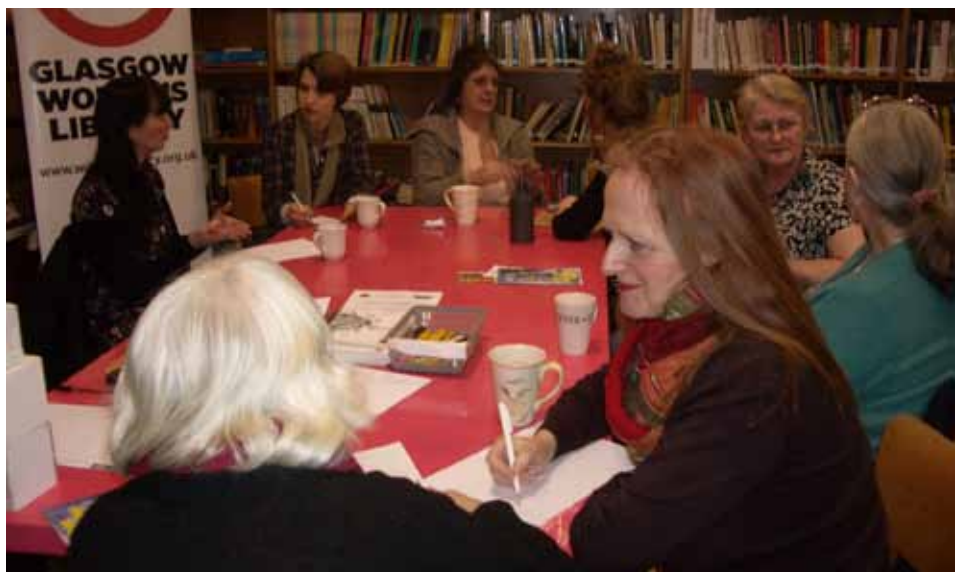
Powered by tea - GWL provides an inspiring and empowering place to keep on learning!