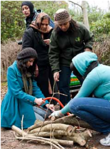
GWL learners enjoy the outdoor life and learn essential skills!

groups from their local communities to appreciate and learn in the outdoor environment.