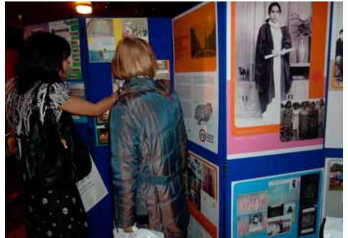
Inverclyde women enjoy GWL's fascinating exhibition

raise money for group funds, and they also produced a publication telling the story of the group and featuring some of their creative writing. The group helped to plan a celebration launch event at Glenburn Library, attended by friends and family, and where some of the girls performed their poetry. We have now helped the group establish contact with the Families and Children Worker from Renfrewshire Libraries and with the local youth service who will continue to support them in developing and expanding the group's activities.