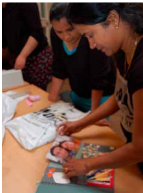
'Lifebooking' in action!

After many discussions with colleagues working within BME communities, it became clear that BME women, especially those who have migrated to this country, do not get many opportunities for self development due to a number of factors, including family responsibilities, lack of culturally competent services and language barriers. We therefore worked with a number of women's groups in Glasgow to help