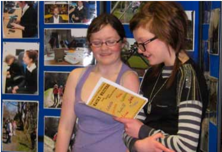
The proud Girls of Glenburn at the launch of their publication