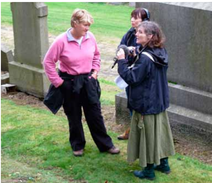
Clare Balding joins GWL's Women Make History Team for the making of BBC Radio 4's Ramblings programme on 'Women in the Necropolis'

The Women Make History team set up a new group this year - the 'Digging Detectives', diverse learners who worked together over several months developing new skills, including tour guiding and research, confidence and team working, to create a new resource for Glasgow - and the latest in our Women's Heritage Walks - a guided walk of 'Women in the Glasgow Necropolis'. The design of a free map of this walk is now nearing completion and we were delighted that this walk was featured on BBC Radio 4's Ramblings programme with Clare Balding, who joined us for an extremely enjoyable day.